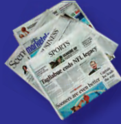
Newspapers and inserts