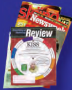
Magazines and catalogs