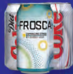
Aluminum cans, aluminum foil and pie tins