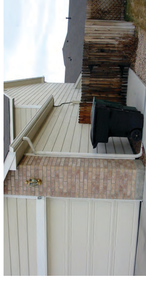
Acceptable Container Storage

All containers stored in areas other than those described above should be screened from public view. Screening devices should be affixed to a permanent structure.