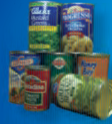
Steel cans and empty aerosol cans