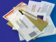
Office paper and junk mail