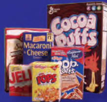
Paperboard (cereal boxes, paper towel rolls, etc.)