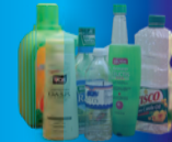
Plastic containers numbers 1-7