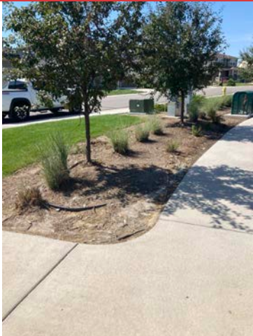
ITEM 30 Remove dead Maiden Grass on end. Install 7-#5 Feather Reed Grass along sidewalk.