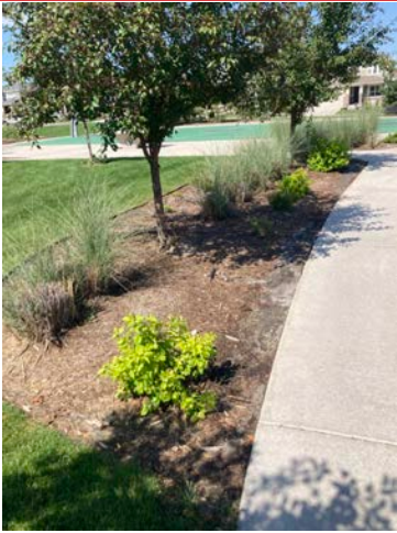
ITEM 26 Install 3- #5 Ninebark to fill space along sidewalk and 5- #5 Feather Reed grass on back side