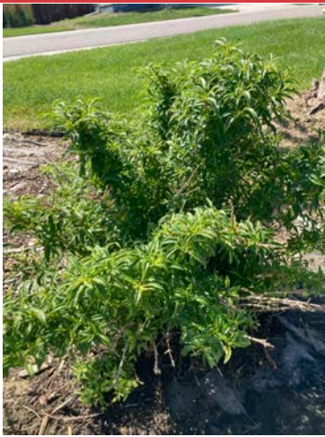
ITEM 29 Sage