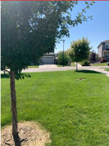
ITEM 24 Install 1- 2" caliper Oak tree where other tree was cut down