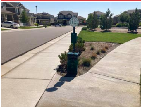
ITEM 10 Remove dead. Install 5- #5 Dwarf Burning Bush & 3- #5 Feather Reed Grass