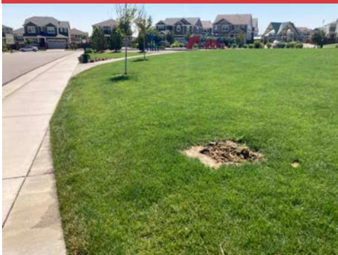
ITEM 11 Install 1- 2" caliper Catalpa near where other tree was cut down