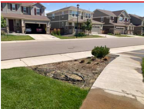
ITEM 12 Install 5- #5 Dwarf Burning Bush