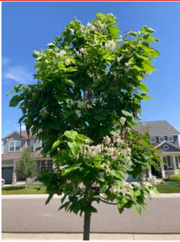
ITEM 9 Catalpa