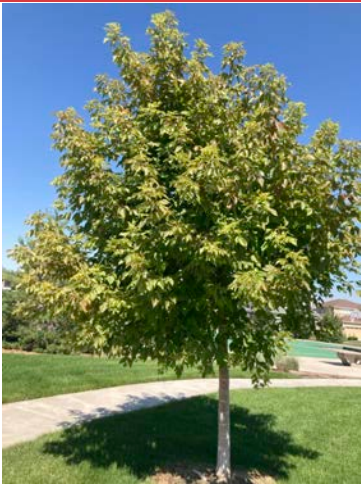
ITEM 22 Box Elder Maple