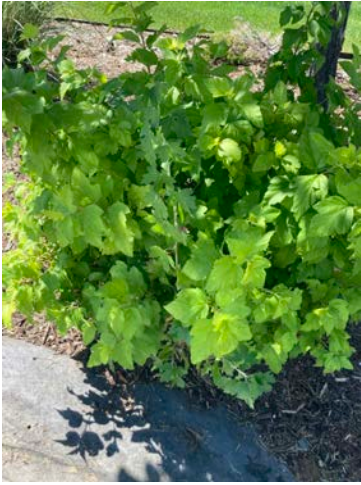
ITEM 25 Ninebark