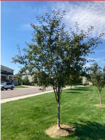
ITEM 27 Bradford Pear